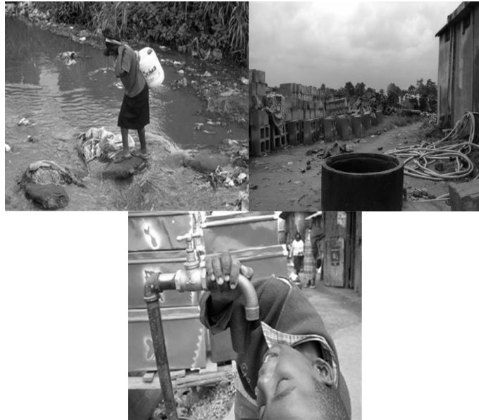
Figure 2. Collection points for samples from left to right: stream, open well, and borehole.